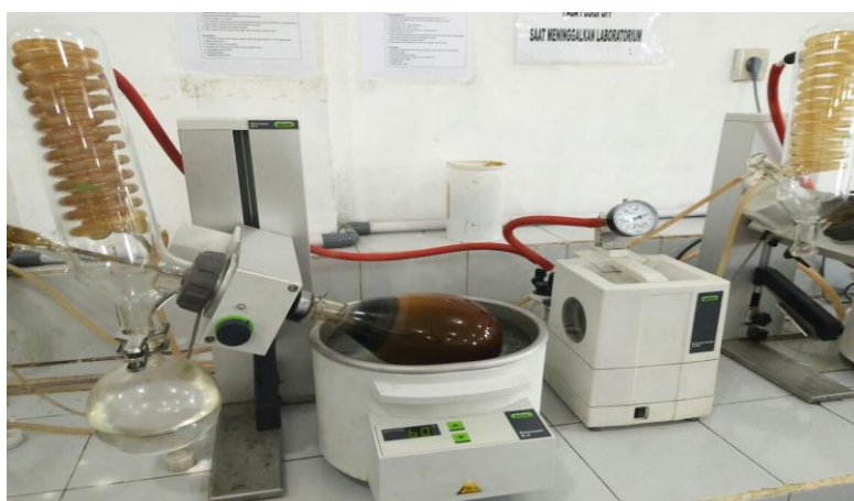
Figure 1: Rotary Evaporator equipment.

The ingredients that had been cut, finely sliced and crushed, were put in a dark bottle with 96% of ethanol until the material was submerged, then the bottle was closed, left it for 5 days by stirred / shake / mixed it occasionally. After 5 days filtered, the result of filter (macerate) was thickened by using a tool “Rotary Evaporator” and repeated up to three times.